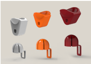
Juice extraction kits

A system developed by Zummo to assemble and disassemble the balls of the kit in just one movement.